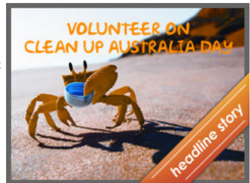
✳ Clean Up Australia Day 1st March 2009